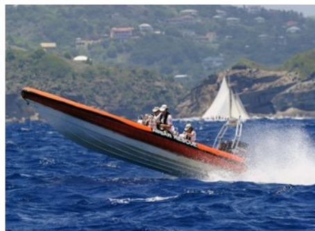
ABSAR RIB During the Classic Yacht Regatta