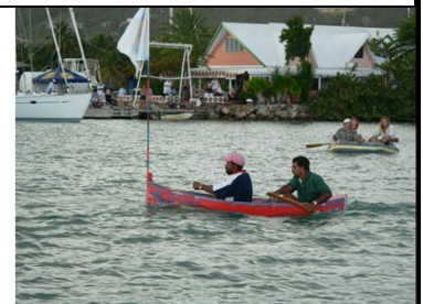
2005 B.Y.O.B. Winners "Darkwood"

For those of you not familiar with this world-famous event, that's Build Your Own Boat! Teams are given 2 sheets of plywood and two hours to build the ultimate vessel to compete in the regatta. In addition to racing, teams must also rescue their own mermaid or merman. This year's event will take place on Friday February 17, 2010 from 1-5pm. Lots of great prizes and a bbq after the event. US$100 entry fee.