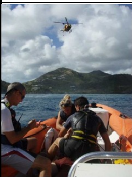
Preparing for Medivac