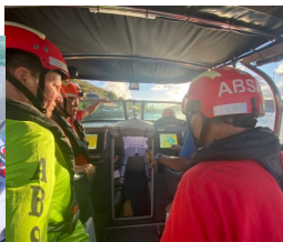
Heading out for Night Training